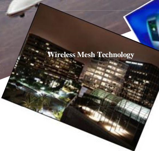
Wireless Mesh Technology

Join the Texas Homeland Security Alliance and others in this timely and informative Border Security Symposium featuring knowledgeable government and corporate guest speakers. Learn more about what Texas is doing for Border Security in the areas of Border Surveillance including UAS's (Unmanned Aerial Systems), Wireless Mesh Technologies, and RFid (Radio Frequency Identification) and how they apply to border security!